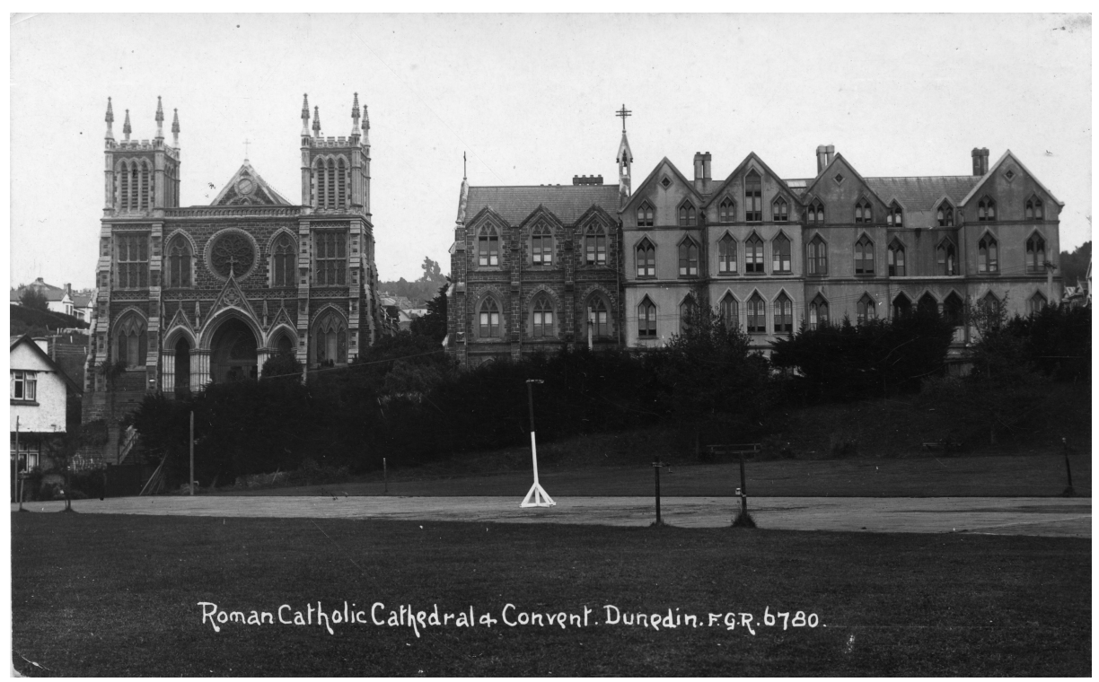
ST. JOSEPH'S CATHEDRAL AND DOMINICAN CONVENT